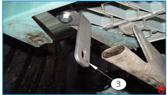
Pilt 6 / Pic. 6 / Рис. 6